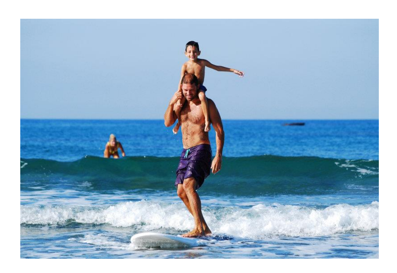
A Beginner's Guide